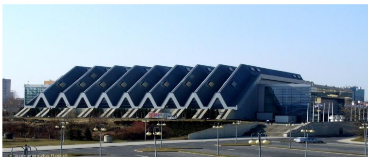
Sport Hall in Rzeszów, Podpromie Street 10